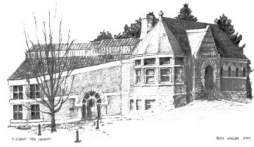
PILLSBURY FREE LIBRARY Warner, New Hampshire