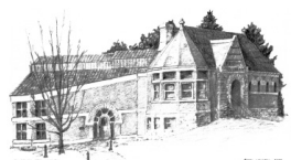
PILLSBURY FREE LIBRARY Warner, New Hampshire