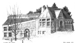
PILLSBURY FREE LIBRARY Warner, New Hampshire