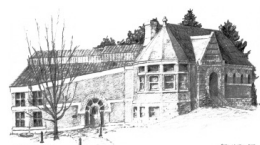
PILLSBURY FREE LIBRARY Warner, New Hampshire